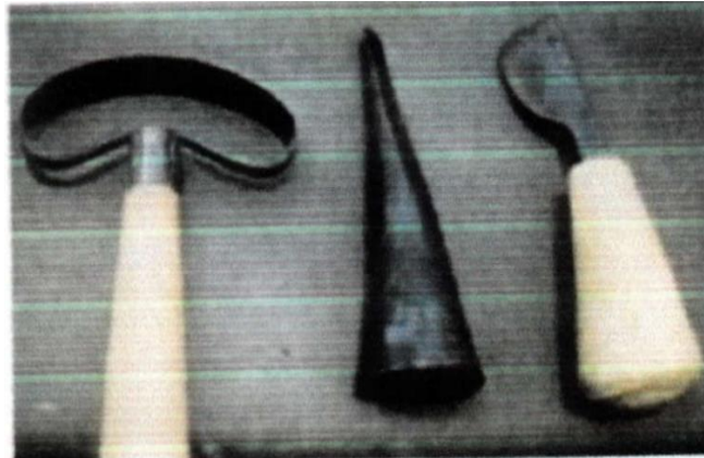
Figure 2. Tap Equipments