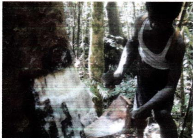
Figure 3. Container Reseptacle