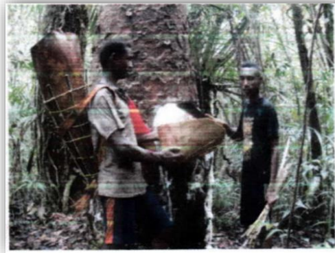
Figure 4. Handler basket