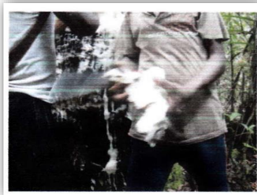
Figure 5. Harvested white resin sap

The harvesting time of resin sap is usually about two weeks to a month after wiretapping is made. The way of harvesting or collecting sap from the pit is to remove / scrape the resin from the pit using a sadap knife. Thus, it can be carried into a container of resin rubber. After all the sap in the pit is collected in the resin container, the pit is cleaned from the remnants of the drying rubber and then it is released to the novelty of the sadap wound. After the all resin in one tree harvested is accomodated in a container of resin, then it put in a 'turtuk' basket which is then transported to the place of collection.