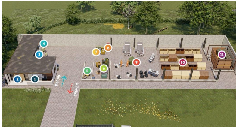
Figure 3. The Layout of the Integrated Waste Management Site of Klawuyuk Village, East Sorong