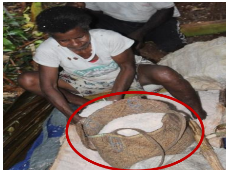
Figure 7. Noken to fill Sago

Ohowo (Moi language) is a type of wood found in the natural forest of Malagufuk village. This type of wood is used to make bags or noken which are used to fill refined sago to be taken to the washing place. The part used is the inner bark which is taken and dried in the sun to dry and then made into noken .