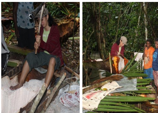
Figure 1. Sago Processing ( Metroxylon sago )

Sago is one of the staple crops of the Papuan people in general. The people of Malagufuk village use this sago to meet their needs, whether consumed or sold in the form of raw sago or sago that is still wet, namely sago that is ready to be processed into food such as papeda. In addition to raw sago, the community also processes the material into dry sago or “Sagu Lempeng”, which is sago that is put in a mold ( forna ) and then burned and the results can be sold or consumed. Sago leaves are also used to make the roof of the house.