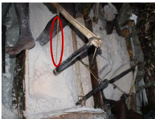
Figure 2. Ties of Sago Bearing Wood from Rattan ( Calamus sp. )

Rattan is used by the people of Malagufuk village as a wooden bond for sago stumps. In addition, rattan rope is also used to tie the roof of the house.