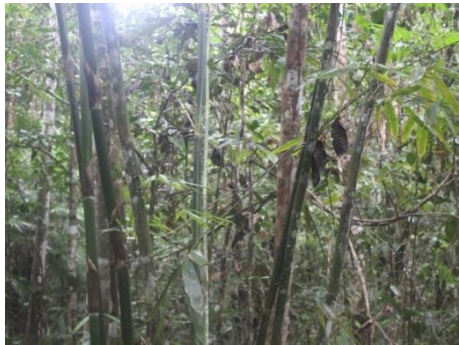
Figure 3. Bamboo ( Bambusa sp. )

2009 in Tang, Malik and Hapid, 2019). The people of Malagufuk village use bamboo as a material for making tent poles and also to cook food by filling food into bamboo and then burning it. In addition, young bamboo is also usually taken to be made into vegetables which are usually called bamboo shoots.