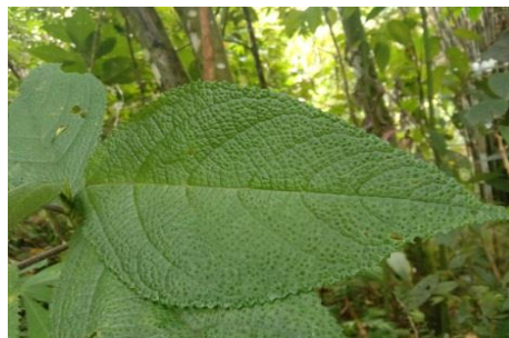
Figure 4. Itchy Leaves ( Laportea decumana )

Itchy leaf is one of the plants that is often used by the people of Malaku and Papua as a traditional medicine that can be used on body parts that feel sore or achy. This plant is also used by the people of Malagufuk village because for them itchy leaves are a very effective medicine when they experience fatigue and aches after doing their activities. These itching leaves are taken for their own use without being sold.